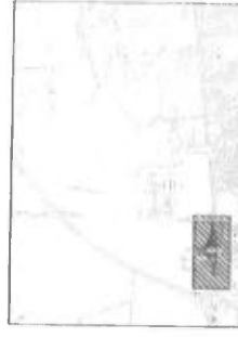
CONTEXT PLAN M/S