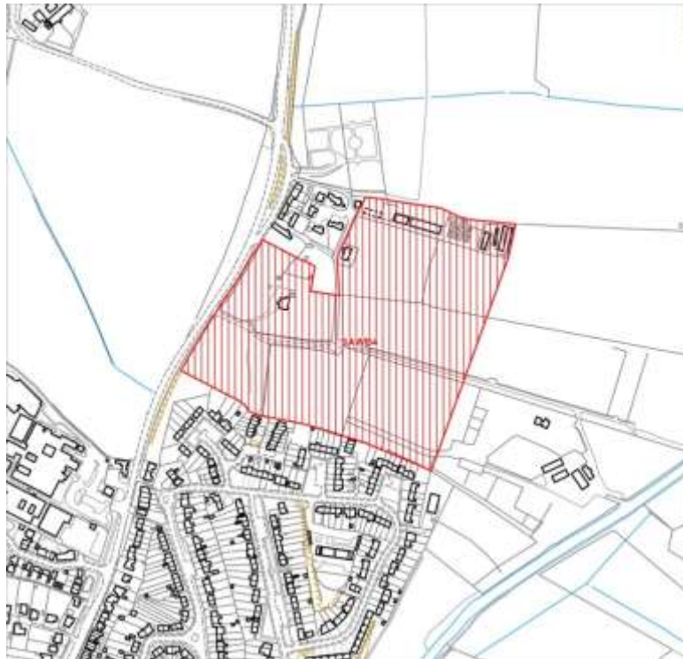
Figure 8.4 Site Location: Land North of Sawbridgeworth

© Crown copyright. All rights reserved. 2018. LA Ref: 100018528.