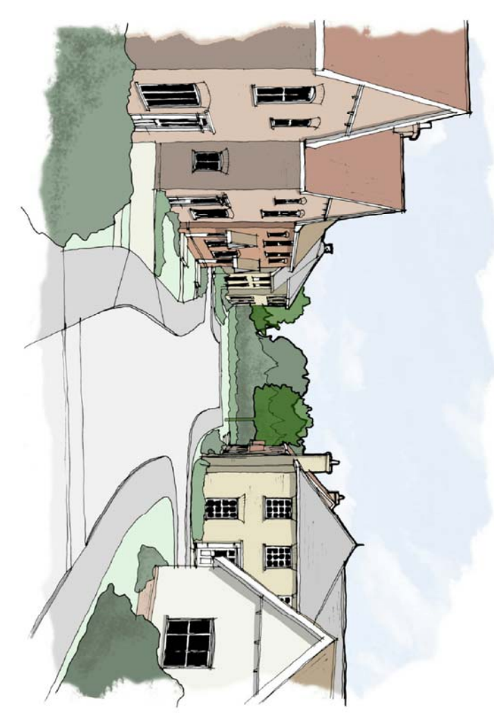
Sketch Perspective (View 2)