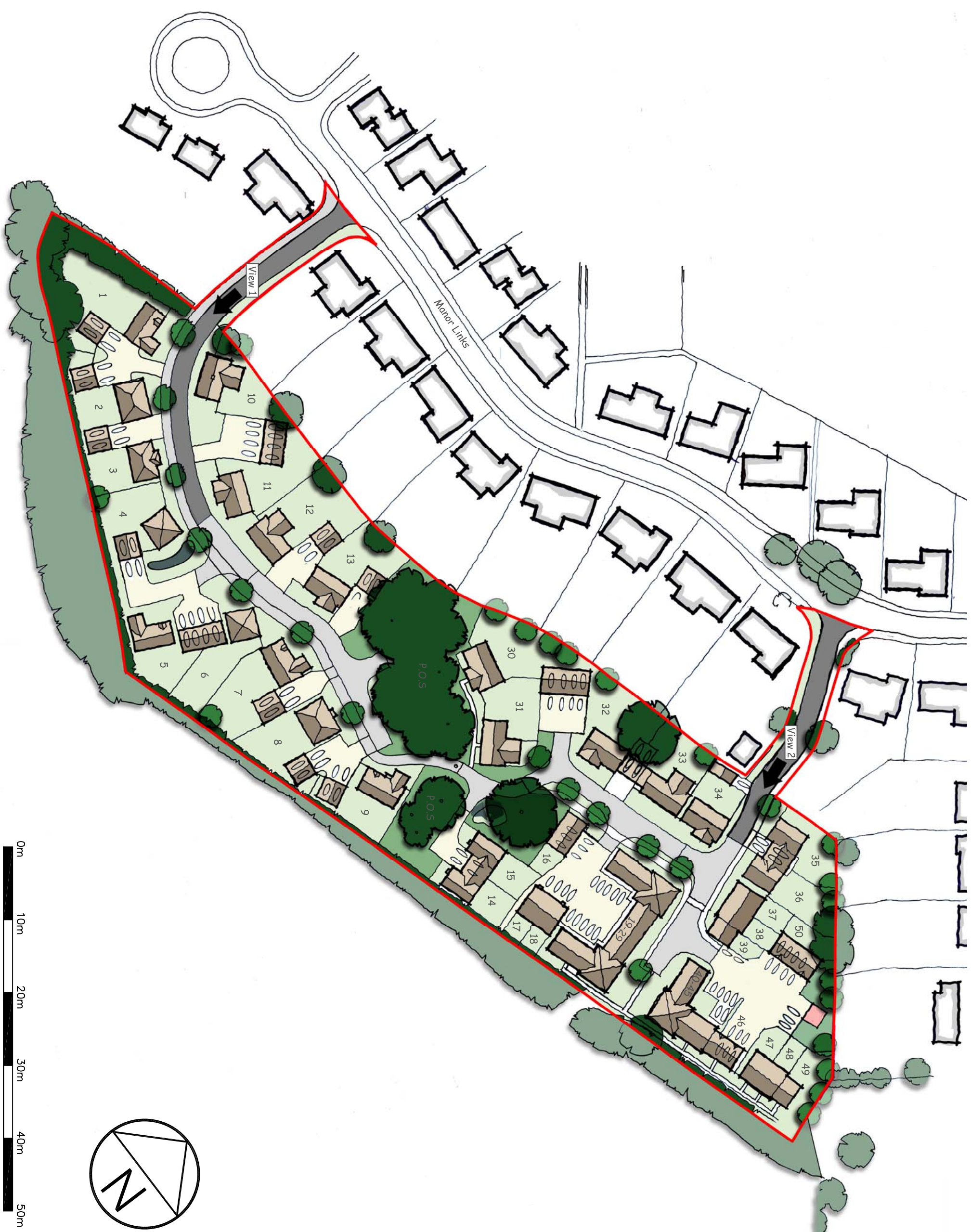
INDICATIVE PROPOSED SKETCH LAYOUT 1:1000